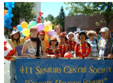
Pride Parade 2005